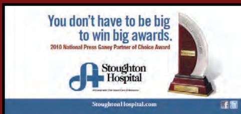
Billboard from Stoughton Hospital's Press Ganey Award marketing campaign.

In November Stoughton Hospital received a national award from Press Ganey, the health care industry's leading performance improvement firm. Stoughton Hospital received the prestigious Partner of Choice Award which is bestowed on clients that have reached and sustained excellence in their patient, physician and employee satisfaction scores. Stoughton Hospital was one of only five hospitals nationwide to receive this top honor.