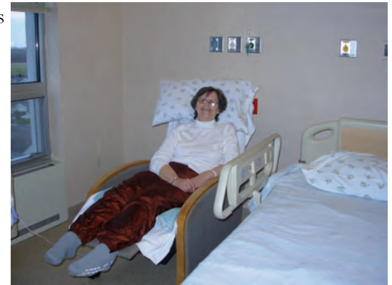
Patient relaxing during her inpatient rehab stay.

While hospitalization focuses on the medical treatment of illnesses and surgery, inpatient rehabilitative care focuses on bridging the gap between hospitalization and home when a person needs additional therapies. Hospital staff consult with patients to design a customized care plan to meet individual needs, enabling patients to return home as soon as possible.